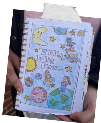
Here is an example from Young Pioneer, Renee!

If it's a song lyric, why not play the song whilst you create!