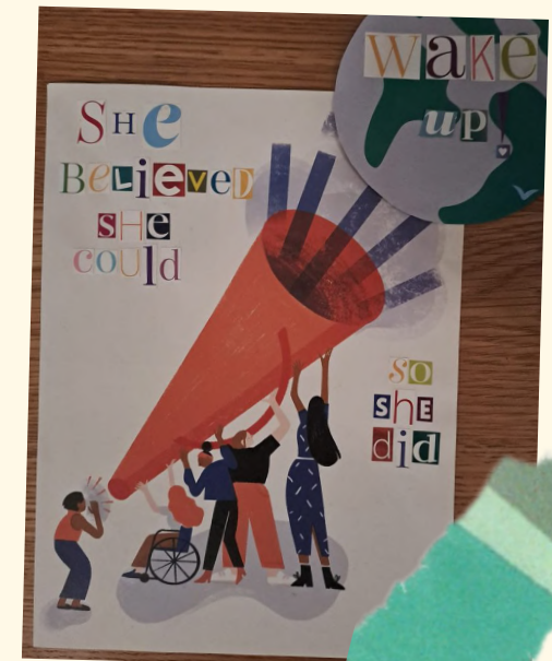
Collage by Ruth Nixon