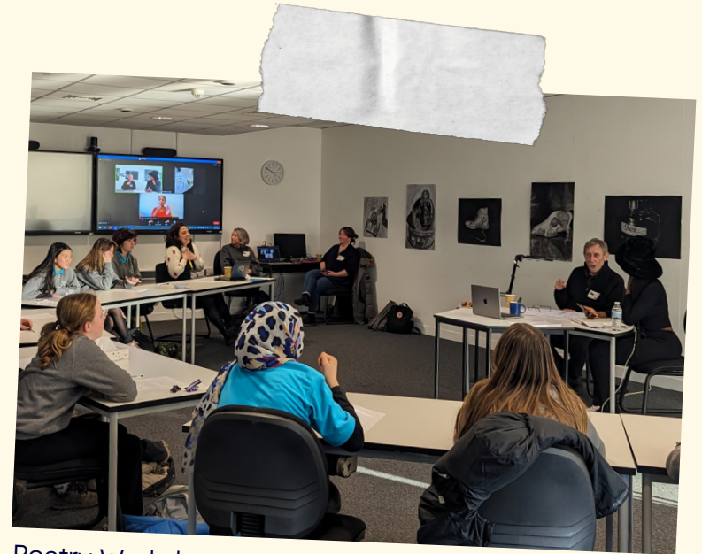
Poetry Workshop with Michael Rosen at Thomas Tallis School for The January Challenge 2024!